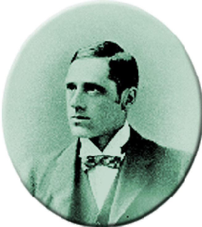
A.B. Banjo Paterson

The poem tells the story of a valuable horse which escapes, and the princely sum offered by its owner for its safe return. All the riders in the area gather to pursue the wild bush horses and cut the valuable horse from the mob. But the country defeats them all - except for 'The Man from Snowy River'. His personal courage and skill has turned him into a legend.